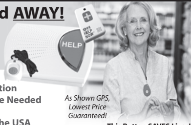
As Shown GPS, Lowest Price Guaranteed!

GPS Tracking w/Fall Detection Nationwide, No Land Line Needed EASY Set-up, NO Contract 24/7 365 Monitoring in the USA