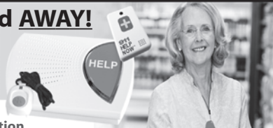
As Shown GPS, Lowest Price Guaranteed!

GPS Tracking w/Fall Detection Nationwide, No Land Line Needed EASY Set-up, NO Contract 24/7 365 Monitoring in the USA