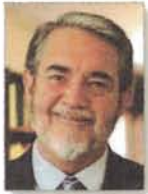
Dr. Scott Hahn