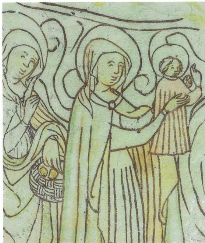
THE BABY JESUS IS TAKEN TO THE TEMPLE FOR CIRCUMCISION, A MEDIEVAL GOTHIC WALL-PAINTING, SWEDEN

When God made man, he did more than command him to exist. Adam, who was to be the son of God and God's helper in the work of governing the world he had created, was mysteriously formed by God, as the Old Testament so frequently tells us, as a potter forms a vessel out of clay. “Then the LORD God formed man out of the dust of the ground, and breathed into his nostrils the breath of life; and man became a living being” (Genesis 2:7). The life of Adam, that is to say the “breath” which was to give actuality and existence and movement to the whole person of man, had mysteriously proceeded from the intimate depths of