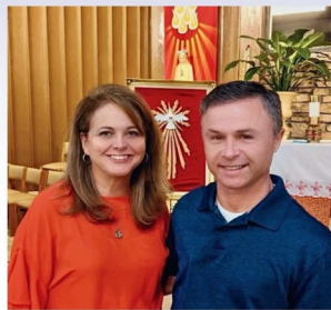
2023 AWARD RECIPIENTS