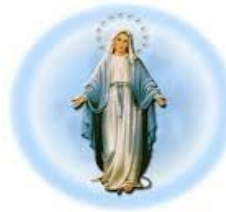
Legion of Mary

Come and share in a potluck supper and play Catholic Trivia on Saturday, August 26 th following the 5:00 p.m. Mass. Prizes will be given for the winners, though everyone who learns more about the Catholic faith is a winner! Sign up sheets for participants can be found in the foyers.